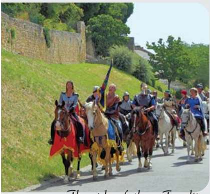
The ride of the «Faydits»

The fall of Montségur (Ariège) in 1244 marked the decline of the movement that ended with the death at the stake of Guillaume Belibaste in 1321, considered by the Church as the last "perfect"!